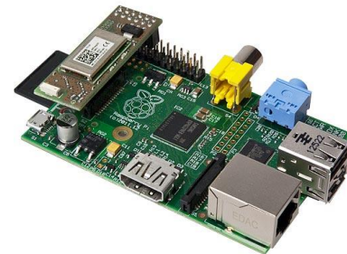
Plugged on Raspberry Pi