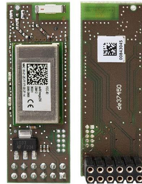
Top and bottom view