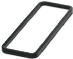
Profile gasket for HEAVYCON EVO supporting base element type B24

Please be informed that the data shown in this PDF Document is generated from our Online Catalog. Please find the complete data in the user's documentation. Our General Terms of Use for Downloads are valid ( http://phoenixcontact.com/download )