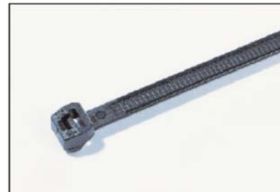
Outside serrated cable ties are also available in natural. Contact HellermannTyton for more information.

The outside serrated cable ties are for specific applications where thin walled or soft insulation is used (such as in aircraft, trains, etc.) and for applications that are very sensitive to the amount of force applied to the cable.