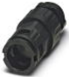
Cable gland, Pg thread, IP68/69k protection, with strain relief

Screw connection - WP-GR HF IP69K PG7 BK - 3240930