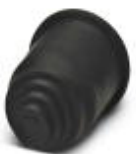
End sleeves, transition sleeves, from hose to cable

Transition sleeve from hose to cable - WP-EC TPE HF 10,0 BK - 3240974