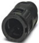
Cable gland, Pg thread, IP66 protection, straight

Screw connection - WP-G HF IP66 PG7 BK - 3240888