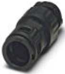
Cable gland, Pg thread, IP66 protection, with strain relief

Screw connection - WP-GR HF IP66 PG7 BK - 3240944