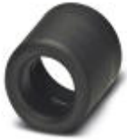
End sleeves as cable protection

Cable protection end sleeve - WP-SC PA HF 10,0 BK - 3240981