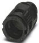
Cable gland, Pg thread, IP68/69k protection, straight

Screw connection - WP-G HF IP69K PG7 BK - 3240874