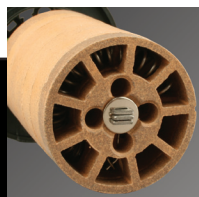
DuraTherm™ Heating Element