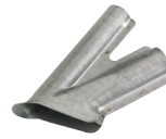
Plastic Welding Nozzle 2.0" x 1.3" x .4" No. 07091