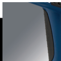
Soft Grip Handle