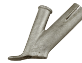
Welding Nozzle 2.6" x 1.2" x .5" No. 07531