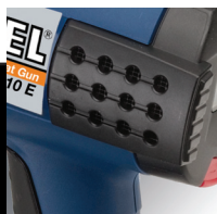
Dual Air Filters