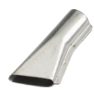
20 mm Lap Welding Slit Tip 2.0" x 0.8" x 0.4" No. 07101